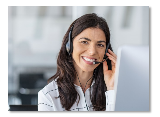
Modifications to this or other policies Any policy of Rapport that does not respect and promote the dignity and independence of people with disabilities will be modified or removed.